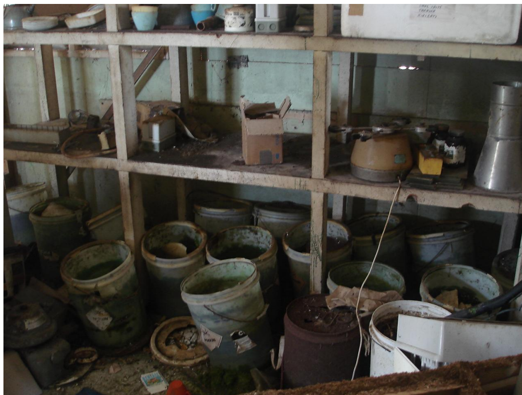
Figure 2.1: Storage of obsolete chemicals is the only current safe disposal option but they still pose potential risks to the environmental and human health.

1. Waste oil shipped to Australia in 2007. The volume was an accumulation from previous years (Langley, KOIL, 2008).